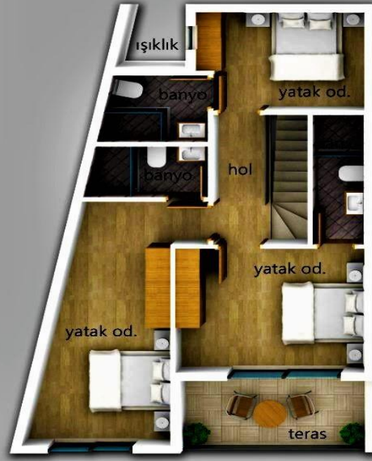
ÇATI KAT PLANI