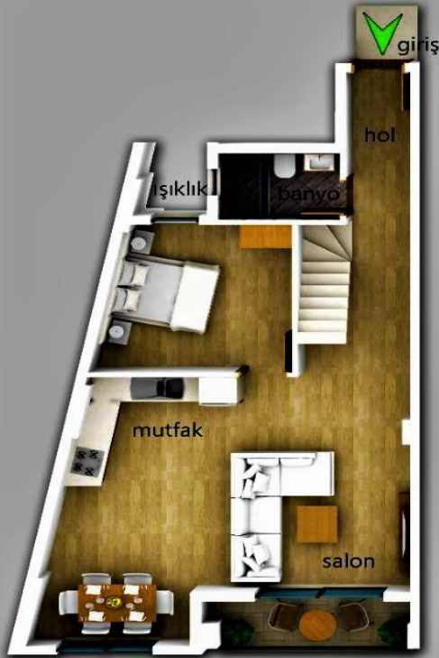
3. KAT PLANI